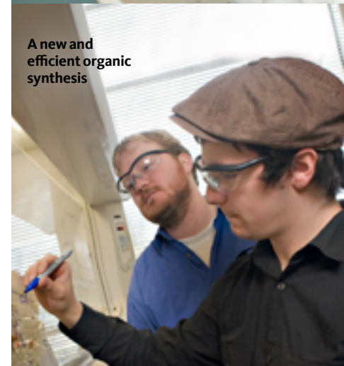
A new and efficient organic synthesis