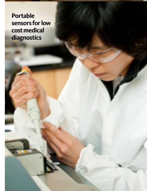
Portable sensors for low cost medical diagnostics