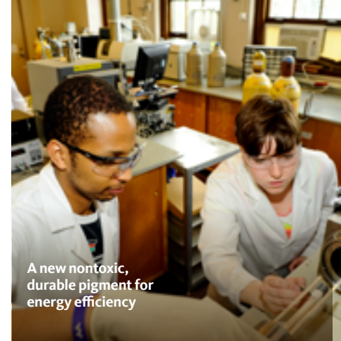
A new nontoxic, durable pigment for energy efficiency

Chemistry graduates are successful in top tier graduate schools in areas of analytical, materials, physical chemistry and bio-organic chemistry as well as in professional programs in science education, business, forensic science, pharmacy, medicine and dentistry. Many graduates work in a wide range of careers throughout the Pacific Northwest and across the country.